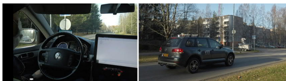
Fig. 1. Trials in the urban intersection

GLOSA is beneficial application for saving fuel of vehicle and there have positive environment footprint [2]. In intelligent